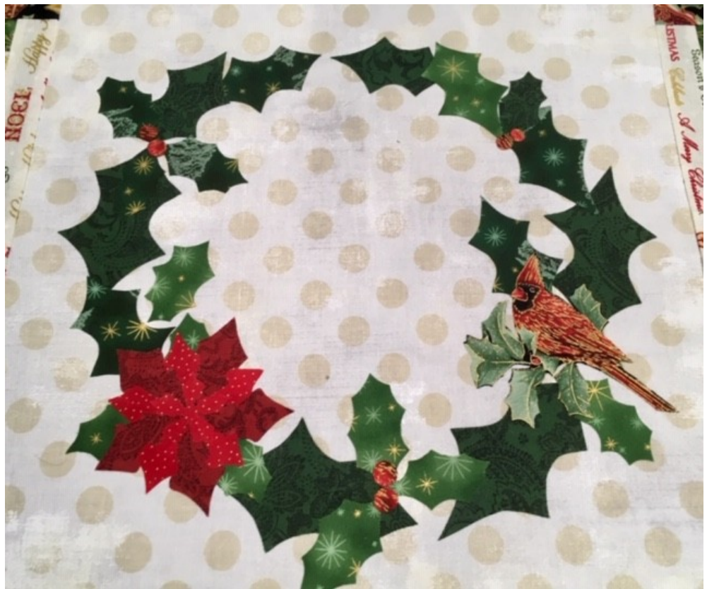
Figure 1: applique placement

Using Cindy Needleham's round frame templates, I marked out a center circle for the wreath placement on my fabric with a frixion pen. You can use a