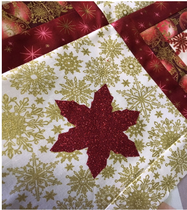
Figure 6: apply the vinyl applique to your solid corner squares