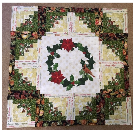
Figure 4: Ready to quilt!