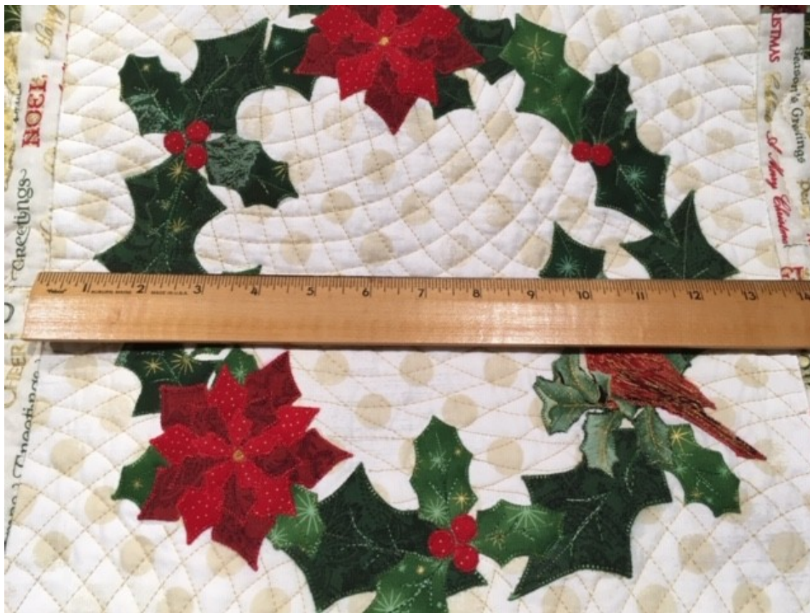
Figure 3: Measuring the applique placement

Head n Bond Lite can be found at JoAnn's, in most quilt shops and fabric shops and on Amazon.