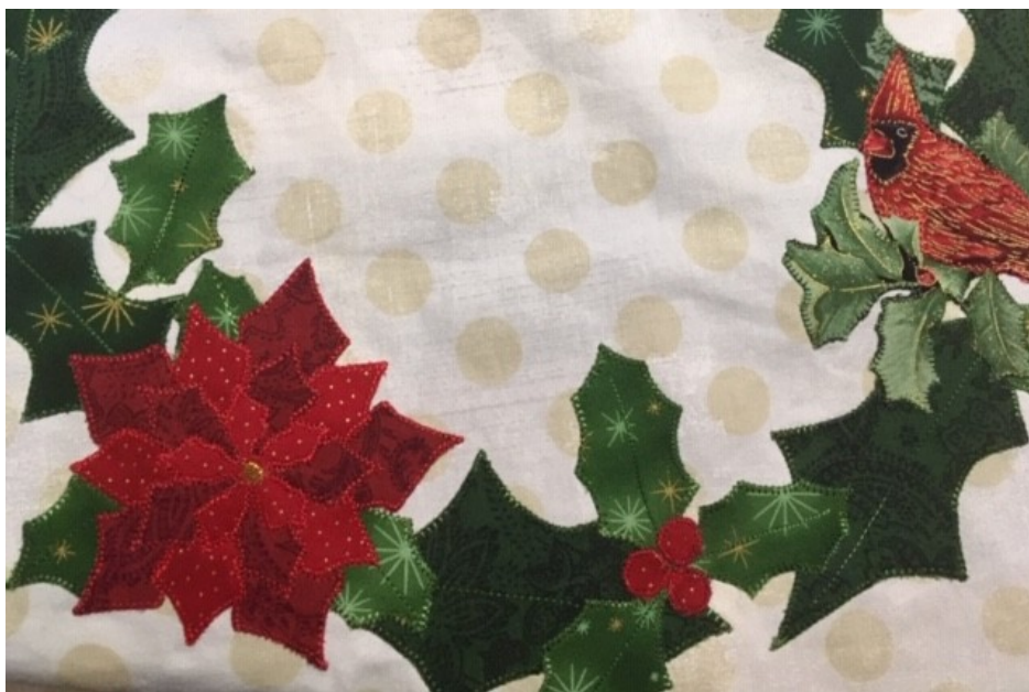
Figure 2: close up of applique with stitching

The holly leaves were composed around the drawn center, using a couple larger leaves in each quadrant and leaving a space for the poinsettias. A holly trio is the base for the poinsettia. I also had a Cardinal, cut from a layer cake scrap with Heat n Bond lite adhered. Both the bird and the poinsettia were then pressed in place and stitched.